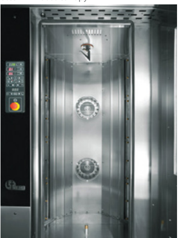
Dual Fan AirFlow System