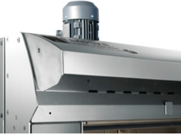
Steam Exhaust Canopy