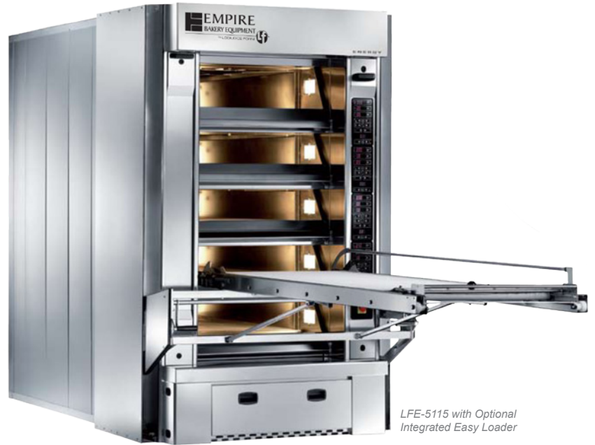
LFE-5115 with Optional Integrated Easy Loader